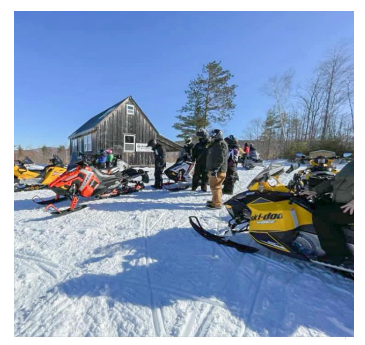
The Birch Ridge cabin is a favorite stopover spot for snowmobilers.

I'd love to connect the Devil's Den area with the rest of the lake trails at some point so snowmobilers won't have to cross the lake. We're working on it, but it's not possible today. I'd love to see some kind of restroom up at the cabin, and we're hoping that the trail to the cabin will be handicapped accessible soon,