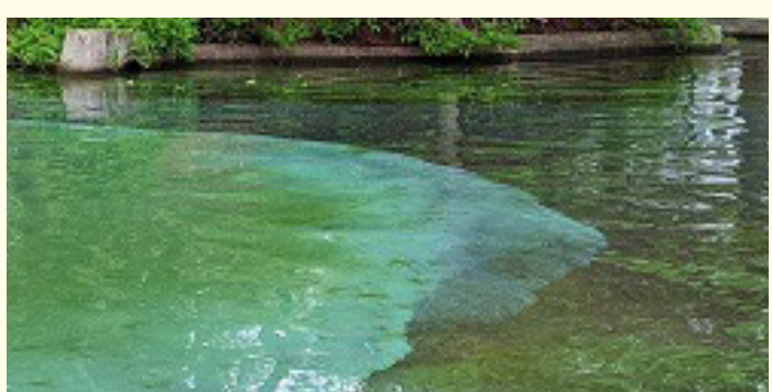
blue green algae bloom on Arlington Mill Pond, Salem, NH (May 2022)

Last year blue green algae blooms were documented on Merrymeeting Lake in Pleasant Cove in August and October. The blooms lasted less than a day and dissipated quickly. The MMLA will be working closely with our water quality monitoring program partners at UNH to watch for any blue green algae blooms this year. If you think you see a blue green algae bloom on the lake, please take a few photos, note the date, location and time of day, and send that information with the subject line "possible blue green algae bloom" to both Brad Smith at royalb@tds.net and Nancy